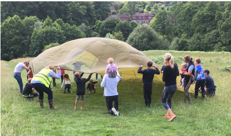
Forest Church On the “Bomb crater Field”

A small group used to meet in the nave at St Lawrence for 30 minutes of bible verse, reflection and prayer. The pandemic forced us to abandon this and, subsequently, a larger group met via ZOOM which has continued every weekday since.