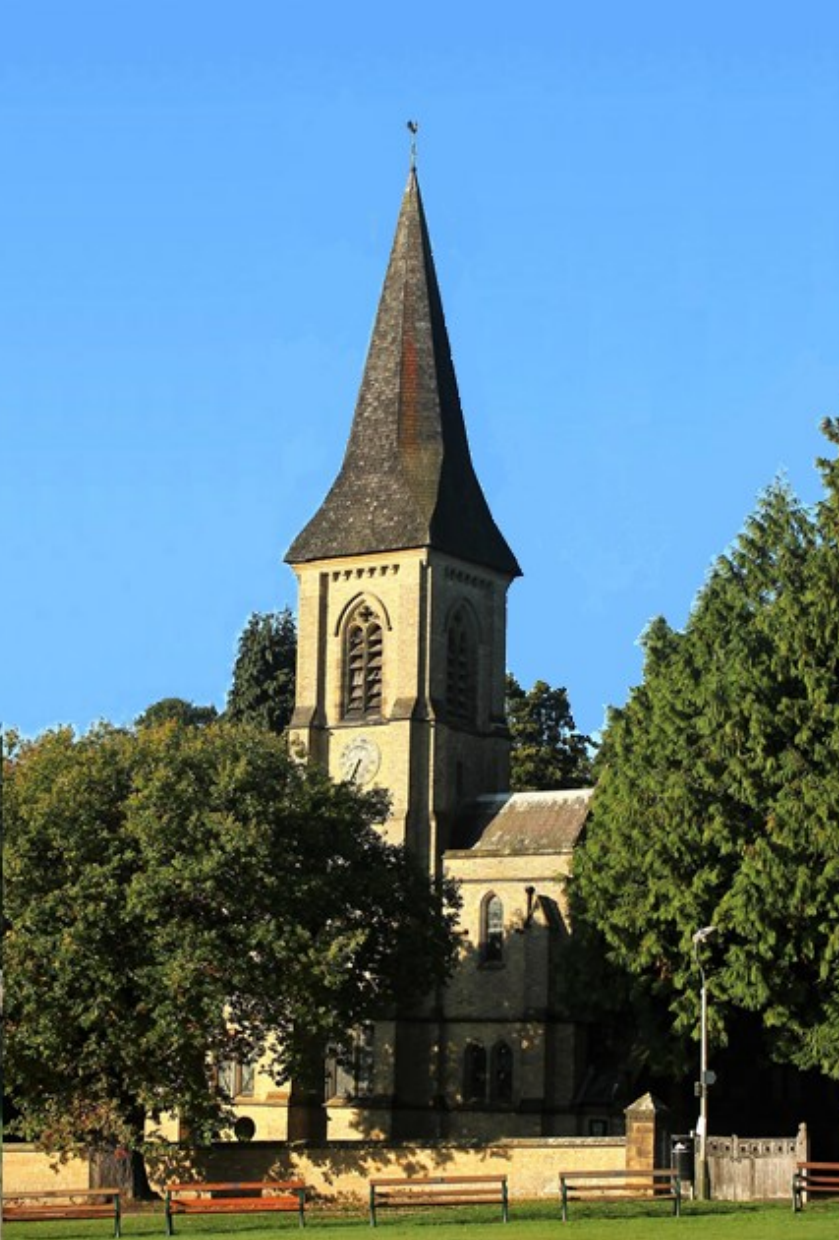
St Peter, Southborough