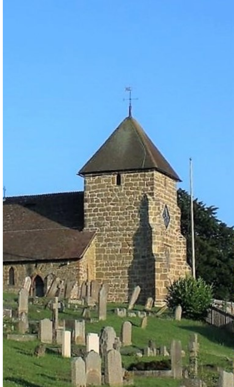
St Lawrence, Bidborough